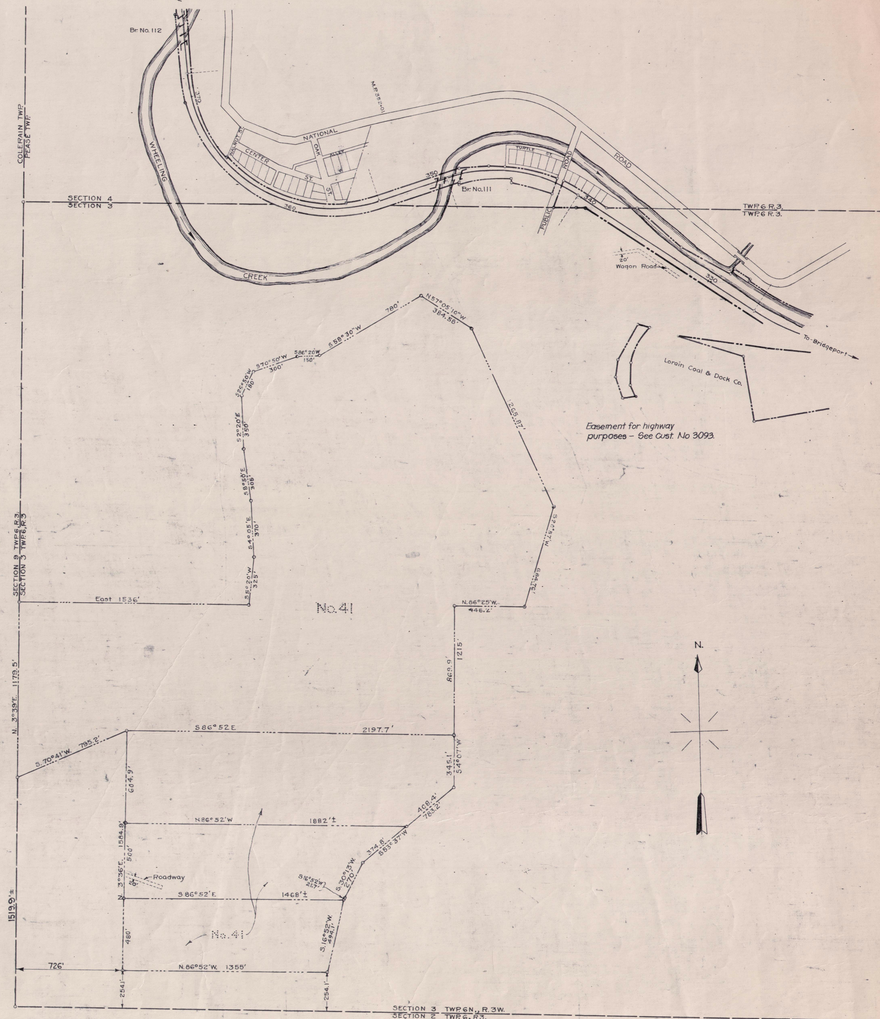
Map No. 2